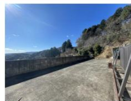
From here, go down the slope.There is a building with shutters that can be used as a garage or warehouse.