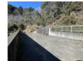
Inside the shutter is a space where multiple vehicles can be parked.From the other side of the shutter