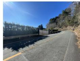
Front road and entrance