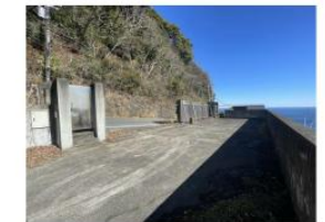
Atami Castle side